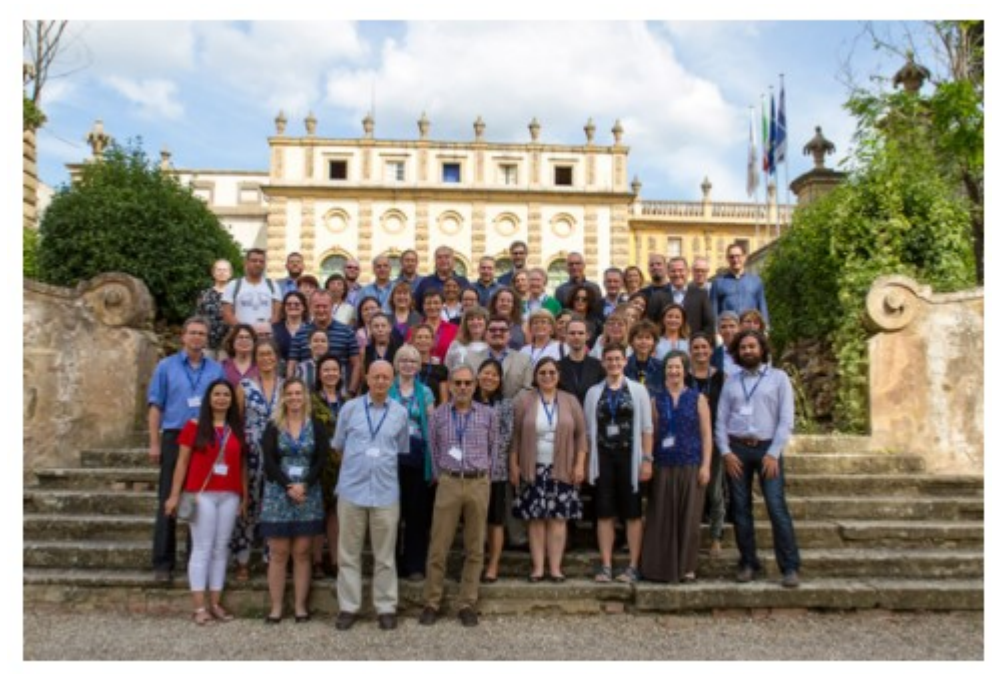
Venue at EUI, Fiesole 2018