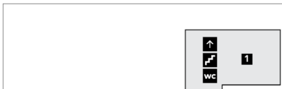
FLOOR -1 (1 – Conference Center)

EURIG seminar and Members` Meeting will be held at the Public Area (Conference Centre on the Floor -1) of the National Library of Latvia in Riga, also called the Castle of Light ( Gaismas pils in Latvian). EURIG delegates will use Main Entrance from the Uzvaras bulvāris (Uzvaras Boulevard) side. Address of the Library: Mukusalas iela 3, Riga, LV-1423, Latvia.