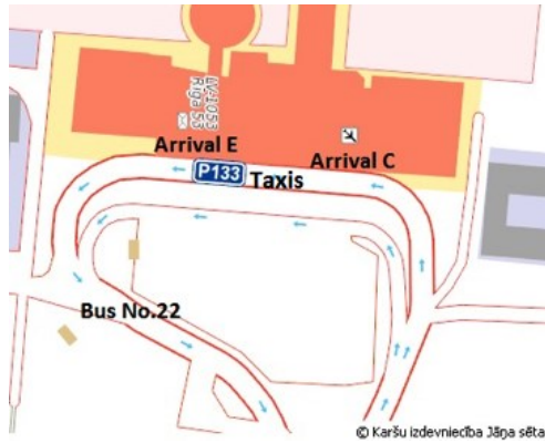
Bus and taxi stops at the airport